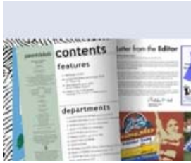
Gulf Coast issue: